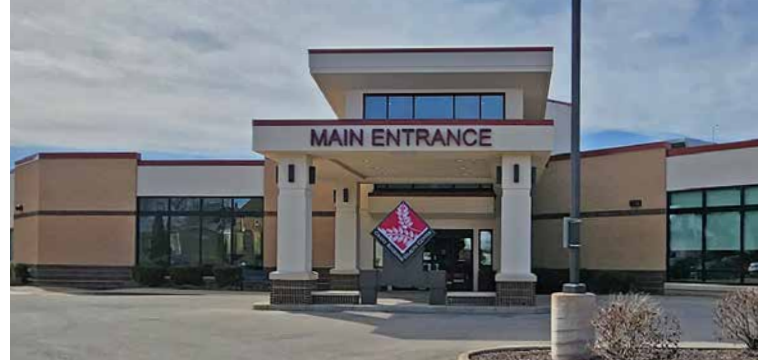
Grant Regional Health Center has served the region for 68 years.

The City of Lancaster is served by an elected mayor and eight-member city council. 15 city committees made up of elected officials and citizen volunteers provide input and guidance on vital public services including parks, the airport, fire department, streets, the library, and how the community grows.