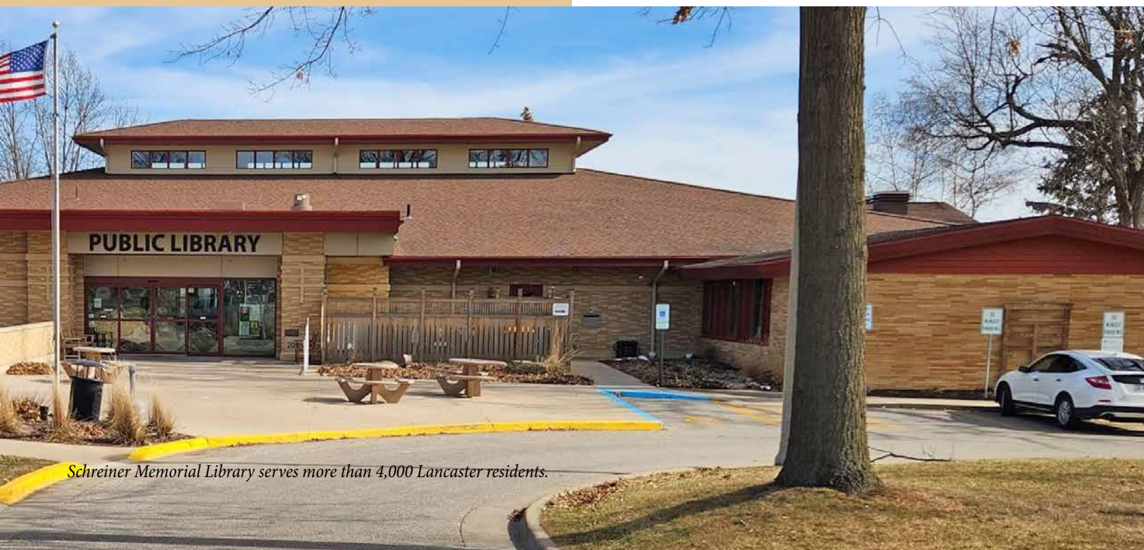
Schreiner Memorial Library serves more than 4,000 Lancaster residents.