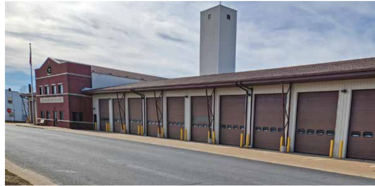
Lancaster Fire Department has served the community for 125 years.