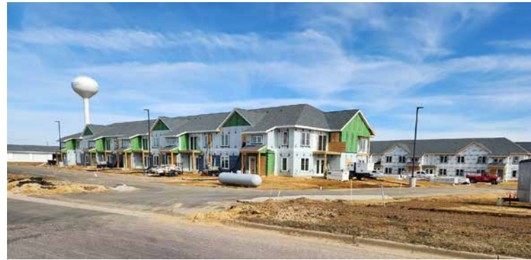
Lancaster is committed to growth that is robust, shared, and enduring.