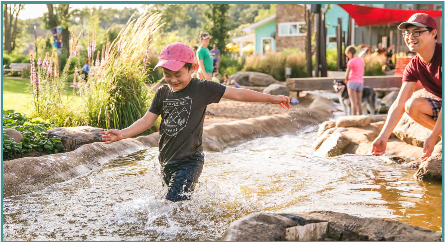
Exception: Image of County Courthouse

Confidentiality must be requested by the applicant and cannot be guaranteed for finalists.