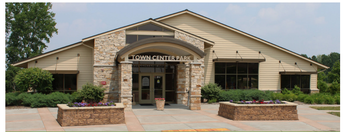
Town Center Park (pictured above) features nearly 24 acres of open space, a playground and a 4,600 square foot community building.

With its mission to respect and value each employee as an essential individual in providing excellent customer service for the citizens, the Human Resources department supports the Town by promoting a diverse workforce with professional and personal growth opportunities, providing consultation and support to the Board and staff, and promoting policies to ensure a respectful, safe, and equitable work environment.